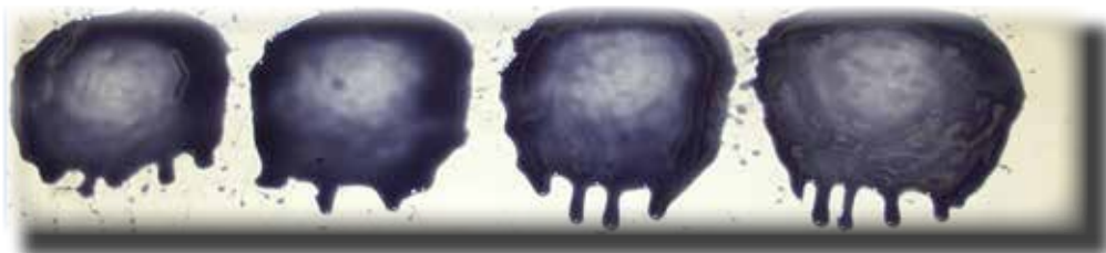
Spray pattern after converting to Pyroshield Syn Open Gear Lubricant. The spray nozzles do not clog with the Pyroshield fluid lubricant, allowing a more protective, uniform film of lubricant to be applied to the gears.