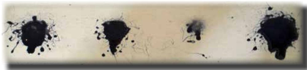
Spray pattern using commercial grade lubricant. Traditional asphaltic lubricants cause spray nozzles to clog, leading to poor application of the lubricant and the creation of damaging hot spots on gears.