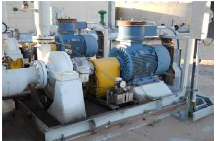
LubriMate® supplying oil mist lubrication to Tank Farm Pump in Australian Refinery.