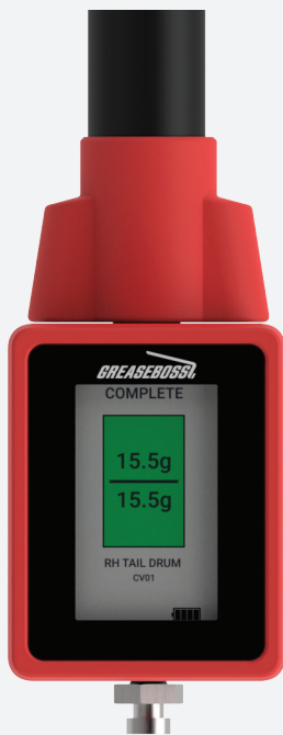
GreaseBoss Manual Head Unit

GreaseBoss ensures greasing is completed to the OEM spec, protecting your interests on warranty claims