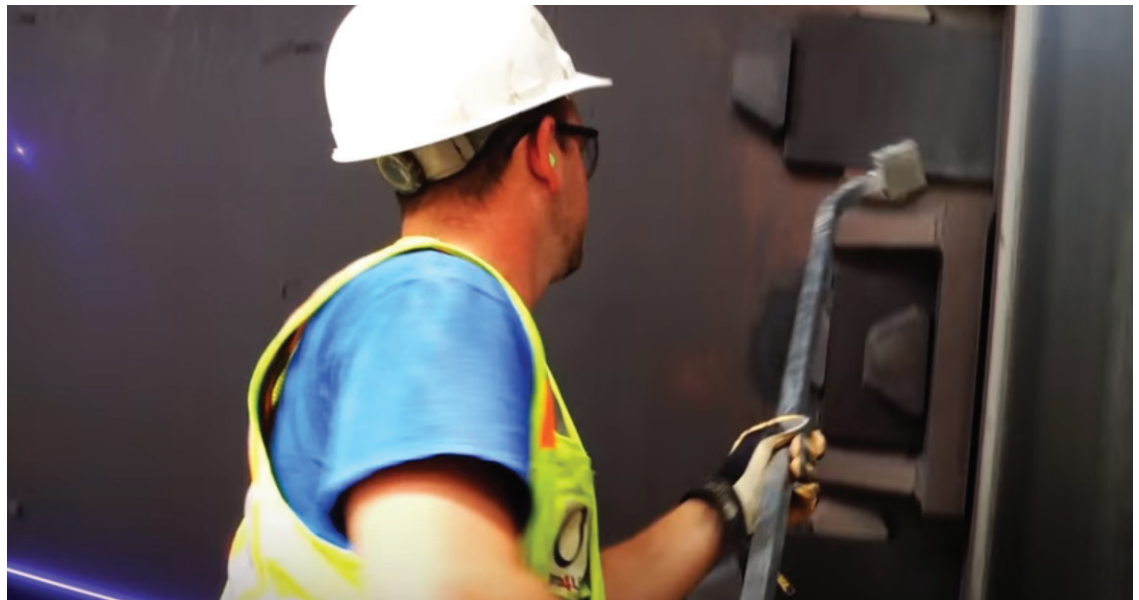
Item #: LEX-EASYBARTOOL

Before inserting an Easy Bar lubricant bar, the kiln should be at an operating temperature of at least 52°C (125°F). Once the kiln is at operating temperature, manually place one bar every quarter revolution between filler bars or pads at the 5 or 7 o'clock positions. Application should be made on the "uphill" side flush with the tire or riding ring for proper lubrication.